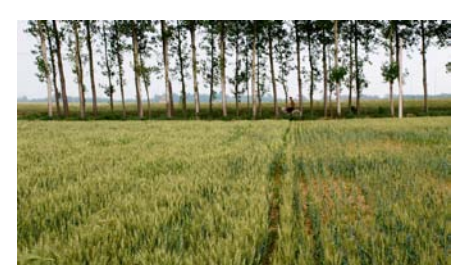
Irrigated winter wheat infested with Heterodera avenae with tolerant (left) and intolerant (right) cultivars growing in adjacent farmer's fields in Xuchang, Henan, China.